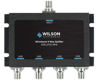
850036 4-Way Splitter