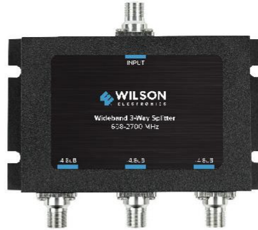
850035 3-Way Splitter