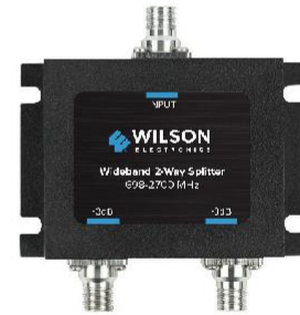
850034 2-Way Splitter